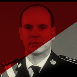
Prince Albert of Monaco II

Nationality: Monaco Active in: Monaco Close relationship with Taib family